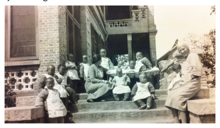
"Children at the Women's Hospital Hwei yuan."

Much of the history of the introduction of Western Medicine into China is to be found in Missionary collections across the USA rather than in China; the Burke's Missionary Research Library holdings are a key source for the project. The project aims to provide an online database of information listing Chinese hospitals