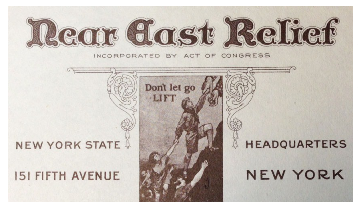
Near East Relief Committee Records