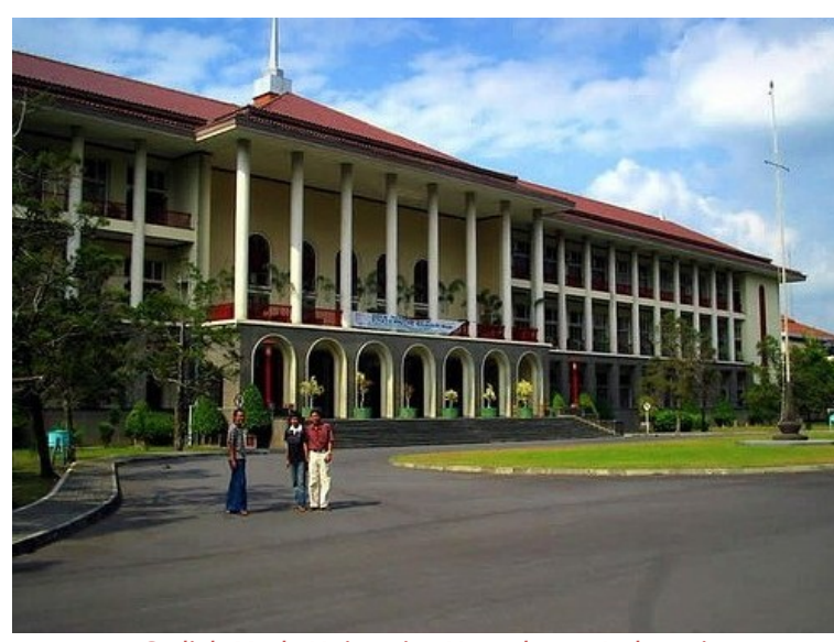
Gadjah Mada University, Yogyakarta, Indonesia

This will mean getting to know the diverse cultures and people of Yogyakarta in order to understand perceptions about music and the relationships between the arts, religion, culture, and the Divine. It will mean allowing