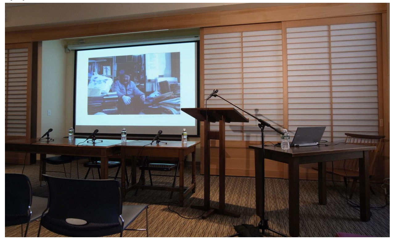
403 Kent Hall, Columbia University

Photographs from "The Makino Collection at Columbia: The Present and Future of an Archive," Symposium, 11/11/11